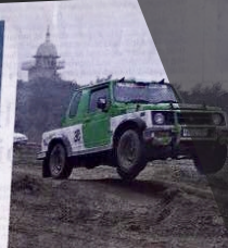
OFF ROAD AUDI RAJGADH ES

THE ONLOOKERS WATCHED WITH BAITED BREATH AS DRIVERS BUMPED UP AND DOWN ON THEIR WAY AND EVEN FELL INTO PITS SITUATED THE TRACKS V OTHERS MAN TO JUMP OFF RAMPS AS W